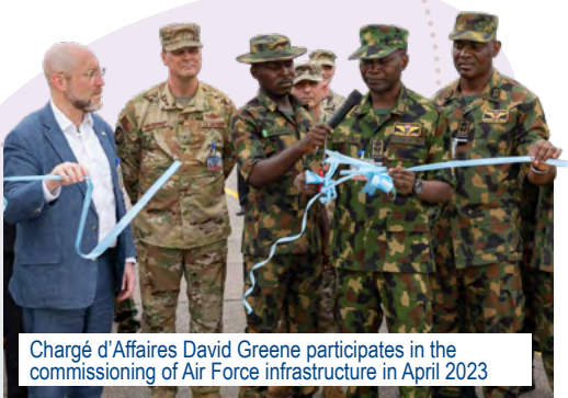
Chargé d'Affaires David Greene participates in the commissioning of Air Force infrastructure in April 2023